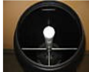
Interior showing break up bars and oxygen tube