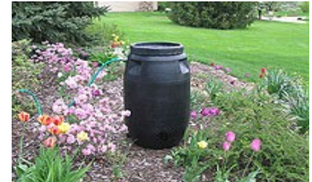
Black Regular Overflow Rain Barrel

Rain Barrels, Tumbling Composters & Accessories