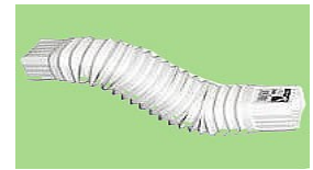
Large and Small Flex Elbow